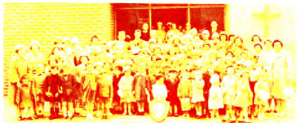
Irvine, Scotland, Sunday school with the District Sunday School Shield, which they won for the fourth time in five years.