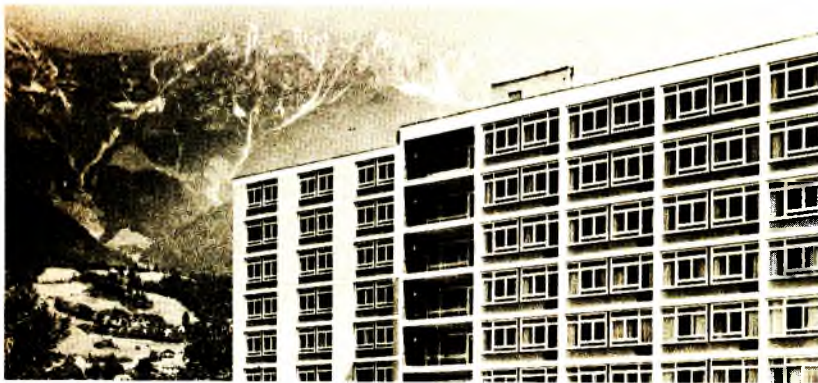
SWISS ALPS CURTAIN N.Y.P.S. INSTITUTE —More than 200 European Nazarenes will gather on the campus of the University of Innsbruck for their first N.Y.P.S. Institute. Their activities will take place in the building pictured above.

In New Jersey, one may drive at eighteen but cannot purchase alcoholic beverages until twenty-one.