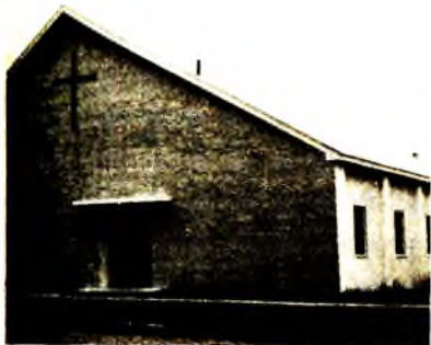
OKLAHOMA CHURCH REBUILT— Following a tornado a year ago, the Nowata (Okla.) church, which was heavily damaged, has been rebuilt at a value of $35,000 with a total indebtedness of about $10,000. The new building is air-conditioned, and will seat about one hundred fifty people in its main auditorium. Rev. James Moore is pastor.