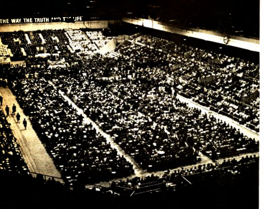
GRAHAM IN ENGLAND—Challenged by Evangelist Billy Graham to accept the way of salvation, 734 persons walked to the front of Earls Court Exhibition Hall, among more than 2,000 persons who came as inquirers the first four nights.