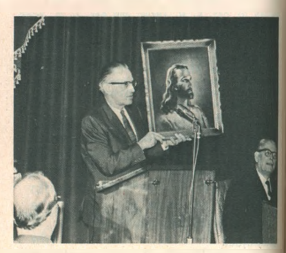
The editor displays special award for runner-up districts which reached their quotas.

All five winning districts exceeded their quotas, with Illinois leading the entire denomination with 6,476 subscriptions—174 percent of their quota. Nebraska's 135 percent was second highest overall. The superintendents of the five winning districts each received an attache case filled with books, and the campaign managers received $100 gift certificates from the publishing house.