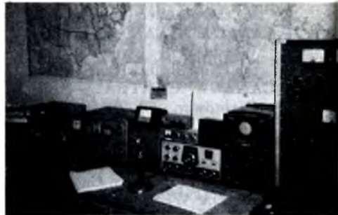
Bethany amateur radio club station

Bethany students also enjoy a time of fellowship with Nazarene college students, missionaries, pastors, and laymen in many parts of the world through regular schedules conducted by NARF. □