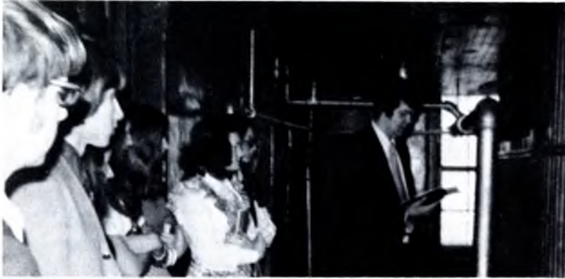
Pictured with youth from Richmond First are students from Mount Vernon Nazarene College, Mount Vernon, Ohio. An elderly man at the prison was won to Christ on the day this picture was taken.