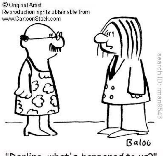
"Darling, what's happened to us?"